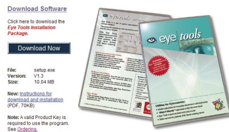
Figure: The "download" area of the website