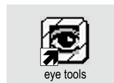
Figure: The desktop icon to launch eye tools