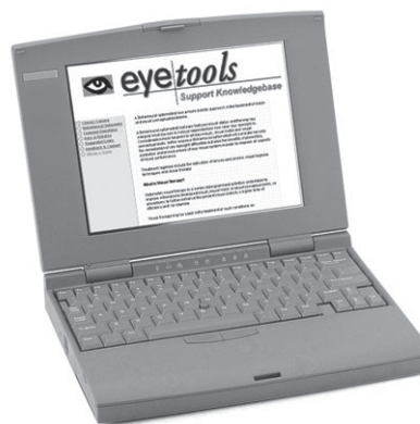
Figure: The Eye Tools Support Knowledgebase at www.hanks.optom.com.au