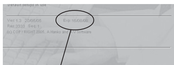
Figure: License expiry date on the Main Menu