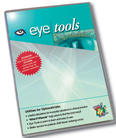
Figure: The packaging for the software CD